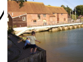
Eling Tide Mill

Y1: local and familiar features, seasonal changes, compass directions Y2: comparing our local area and map work.